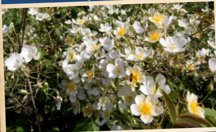
Rosa Filipes Kiftsgate

Rosa filipes is part of the rose family and is from China. It has small white flowers which grow in clusters of up to 100 flowers. It can be very fast growing, sometimes reaching 10 metres tall!