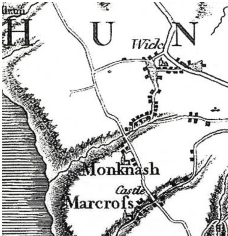
George Yates' Map of Glamorgan 1799 (part)

Broughton stands beside Nash Brook slightly upstream from the 20 acre site of the 12 th century monastic grange at Monknash. A monastic college is reputed to have stood at the western end of Chapel Road (in the Monknash Conservation Area) and it is likely that the settlement originated in the 12 th century due to its wells and water supply and its proximity to the extensive monastic grange.