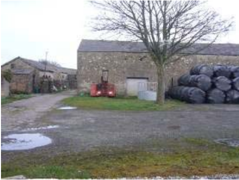
Stone walls and slate roofs are the prevalent building materials within the area (West Farm).

A long range built as a 3-door cow house with stable to left. Rubble stone with quoins and dressed openings. Steps against the west gable end lead to a first floor doorway to former hayloft.