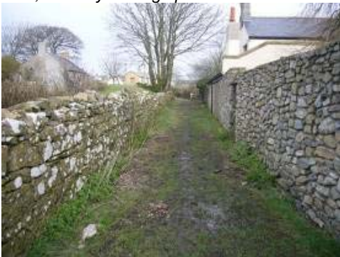
A public footpath, lined with stone walls, leads westward from Broughton Road.