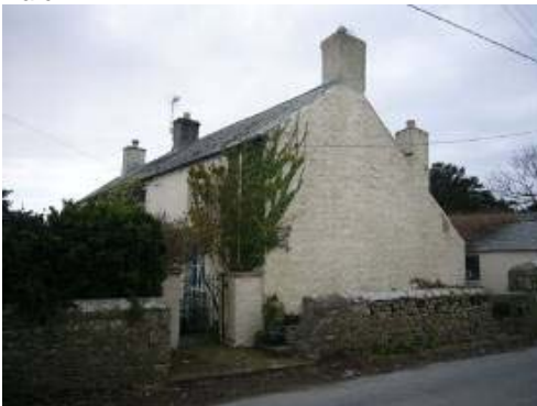
The main characteristic of West Street is the widely spaced cottages gable end on to the road