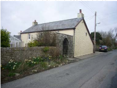
Many of the stone buildings have been colour-washed.