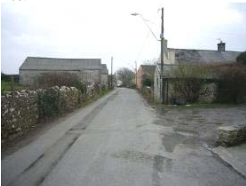
A stone wall takes the place of a hedgebank on the east side of West Street.