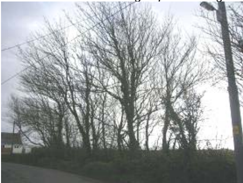
Trees are part of the rural ambience of the area and will need careful management.