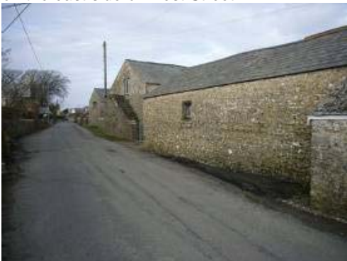
The agricultural legacy of the area is most visible at the northern end.