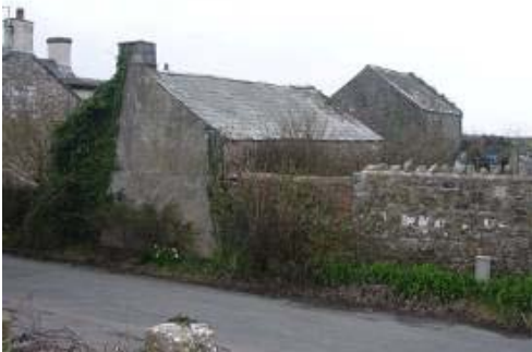
Stone walls under roofs of slate are the prevailing building materials.