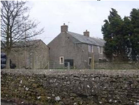
Stone walls are a feature of the area. Most are in good repair.