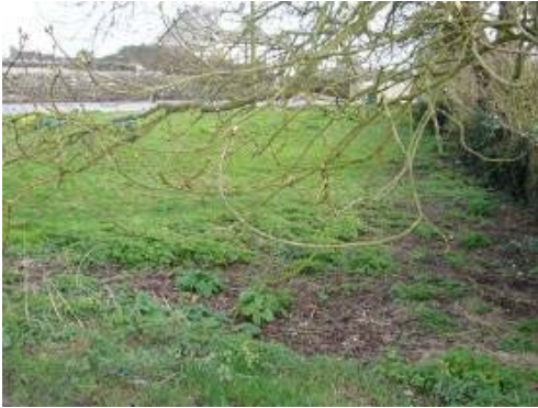
The small roadside 'green' in the north of the area, formerly a village pond.