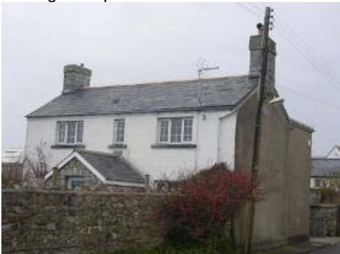
Many buildings have had their original timber windows replaced with UPVC.