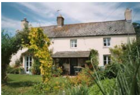
Little West Farm

Former farmhouse now used as a dwelling.