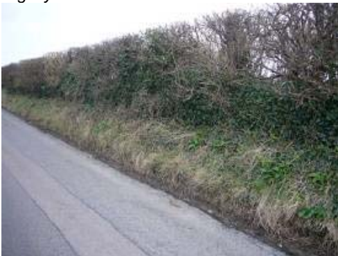
The level of the fields on the east side of West Street is much higher than the road, giving rise to hedgebanks.