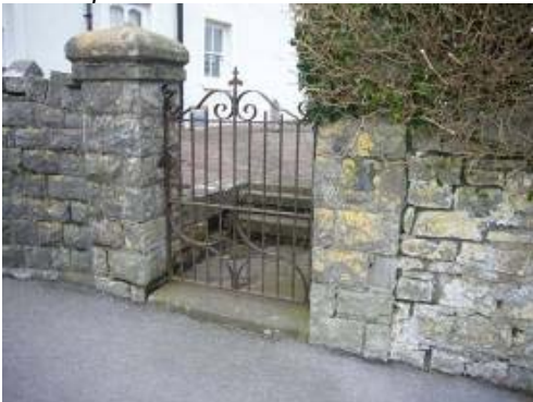
Stone gate piers and a decorative iron gate add to the local distinctiveness of the area.