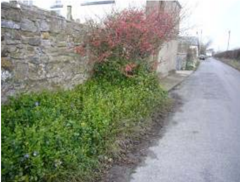
Shrubs and planting bring colour to verge of West Street.