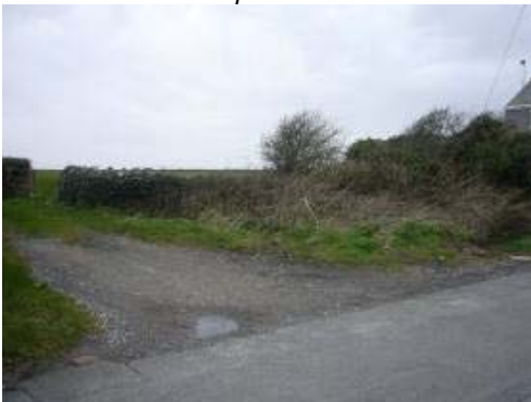
A gap in the boundary of West Street just north of Le Chateau permits views to the west.