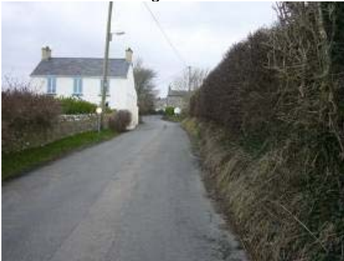
Grass verges can be found on both sides of West Street.