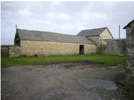
Farm Range to North-east of Brooks Farm.