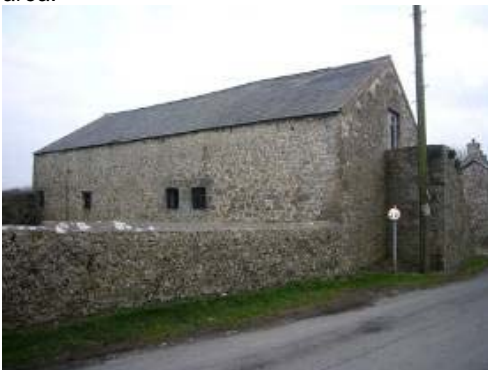
Grade II listed 19 th century farm building, part of an attractive ensemble of farm buildings at Brooks Farm.

West Street has a strongly defined linear form and distinctive settlement pattern derived from dwellings with gables set at right angles to the road. The few exceptions are late 20 th century dwellings such as Fairwinds and Holmfield which face the highway, set back from the road. Between Ash Cottage and Westward House there is no development on the east side of the lane. The ground level of the east side of the lane is at times well below the roadside fields which, combined with a near continuous length of roadside stone walls bounding properties on the west side, almost give the impression of a sunken hollow way.