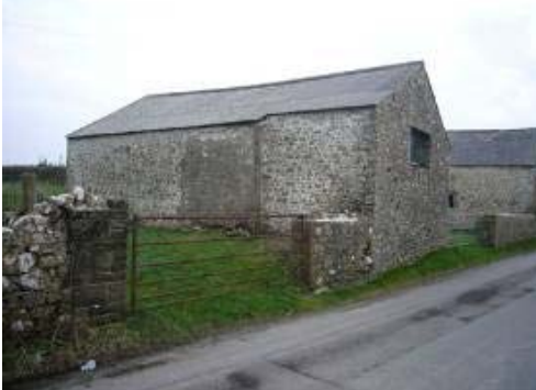
The conservation area is notable for vernacular stone farm buildings typical of the Vale.