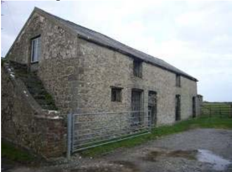
Cow House and Stable Range to North-east of Brooks Farm.