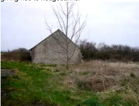
A stone shed in the south of the conservation area.