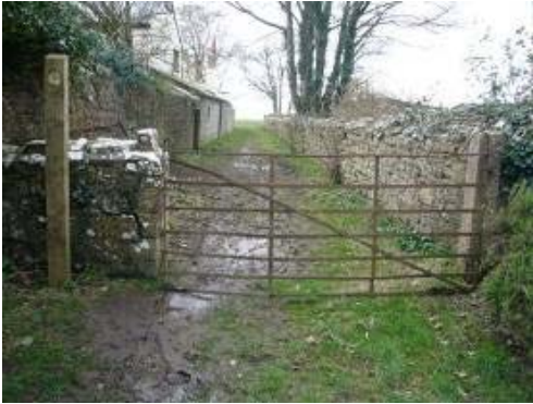
The hamlet is connected to other settlements via a network of footpaths.

The Broughton Conservation Area is comprised of two historic building groups at either end of West Street, a narrow lane from the ancient well at Nash Brook in the south to a small green at the outer limit of Wick. Roadside development on the west side of West Street forms a third component of the area's special historic interest.