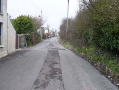
The width of West Street varies and it curves slightly as it rises from Nash Brook.