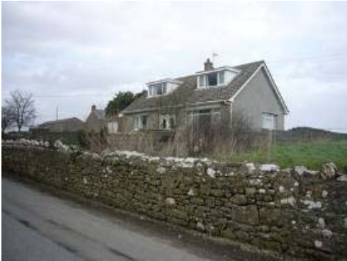
Modern infill has begun to erode the historic character of the northern group of buildings.