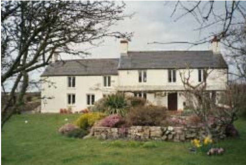
Old Carpenters Arms