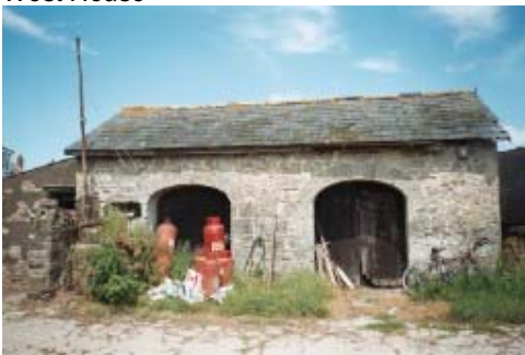
Victorian Slaughter House