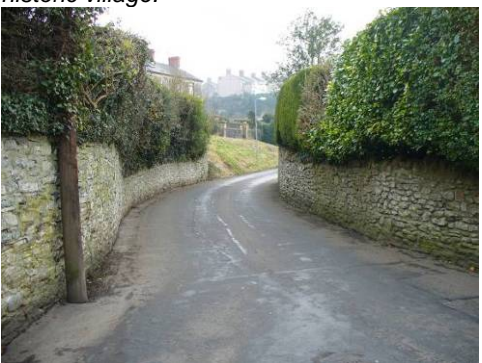
Coldbrook Road West provides a reminder of the rural origins of the area.