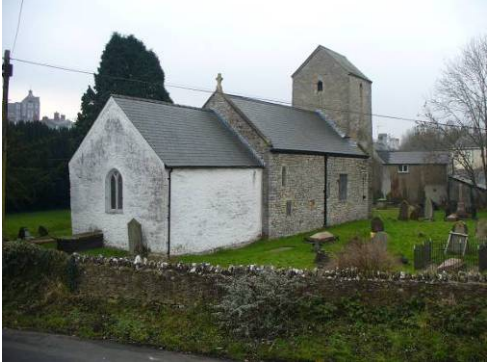
St. Cadoc's Church.