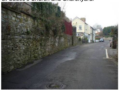
High Limestone walls provide enclosure at Coldbrook Road West.