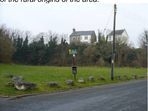
Little Hill Park. A former quarry that now forms one of many open spaces in the Conservation Area.