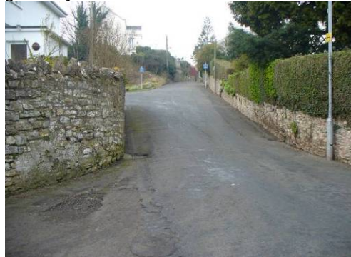
View north west along Coldbrook Road West.