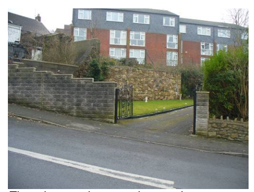
There is some inappropriate modern development within the Conservation Area.