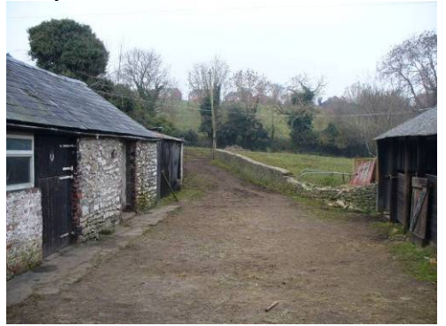
Small, rural buildings survive in an area surrounded by urban development.