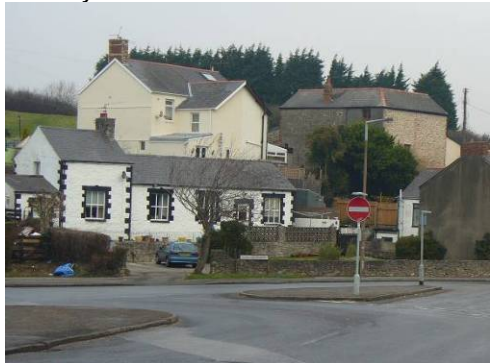
Old School House.

In the south-west of the conservation area, buildings relating to the Victorian Cadoxton Methodist Church occupy a south facing frontage on higher ground. The chapel is constructed in local stone with a bell cote. The adjacent hall dates from 1931 and is constructed in brick.