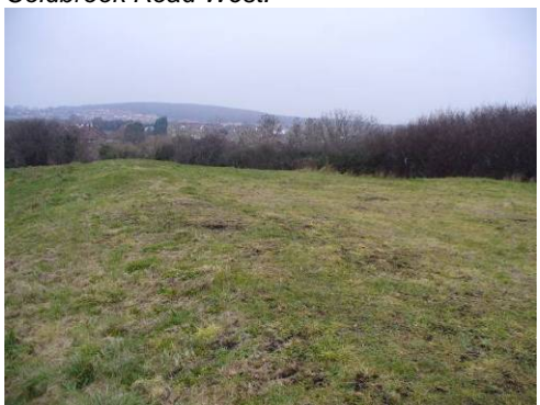
Green open space at Cassy Hill, including suggestions of buried remains.