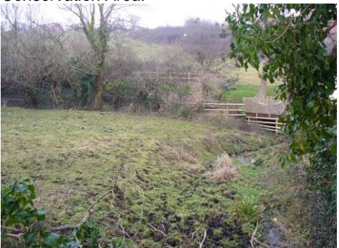
Fields to the west of Hebbles Lane provide further reminders of the areas agricultural origins.