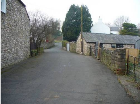
The rear wall of Yew Tree House provides enclosure to the lane.