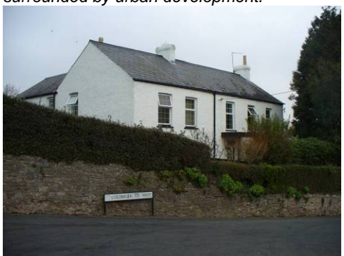
The historic cottages and farmhouses are generally set back from the road.