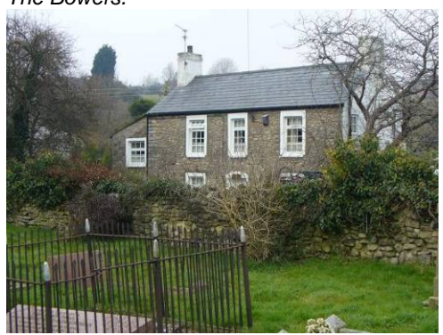
Yew Tree House.