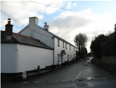
The Corner House

A small house of early C18 date with simple roughcast facades, fenestration with traditional casement windows. The building has a lobby entry plan, with a small bake house added at the entry end.