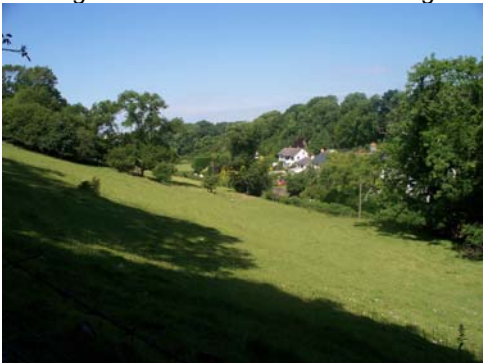
View over Barrenhill from road at Cwm.

Spatial analysis, is concerned with how buildings relate to each other and the space created between and around those buildings. It also examines how views are created and how they may change as the space is passed through.