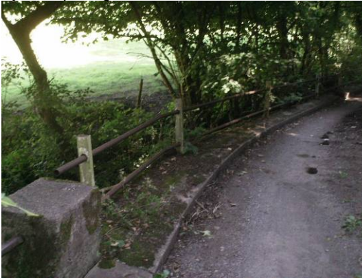
Poor boundary treatments.