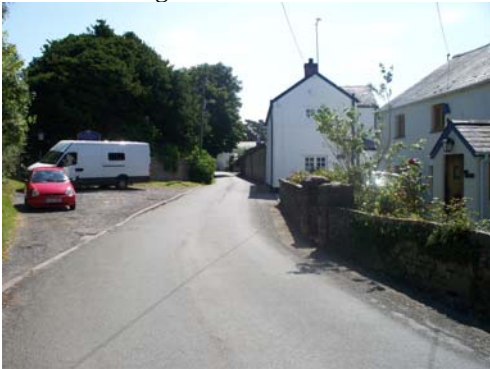
The village is based upon historic linear development.