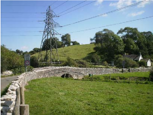
Pylons spoiling views into the Conservation Area.