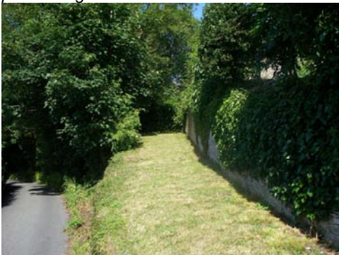
This grass verge is likely to have served as a field access previously.