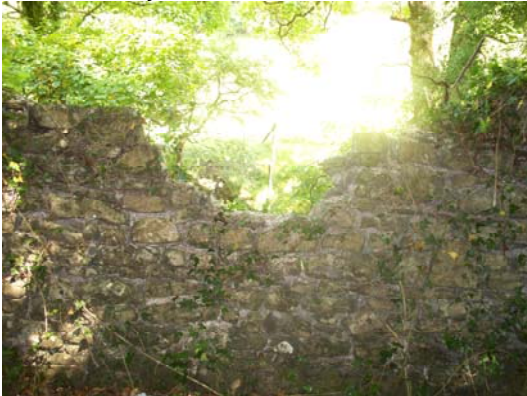
Some stone walls have been damaged.