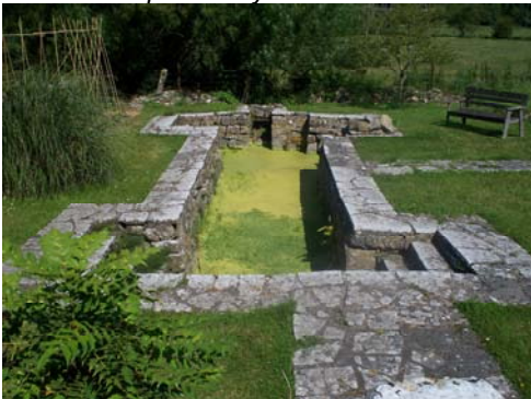
This former well is now an attractive water feature in an orchard.