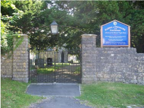
Details such as the church's stone walls, piers and gates add to local distinctiveness.