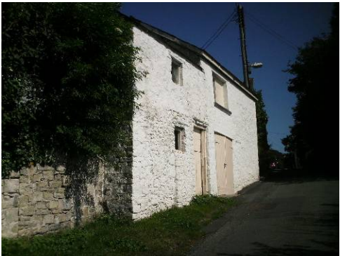
Former agricultural building at The Mount