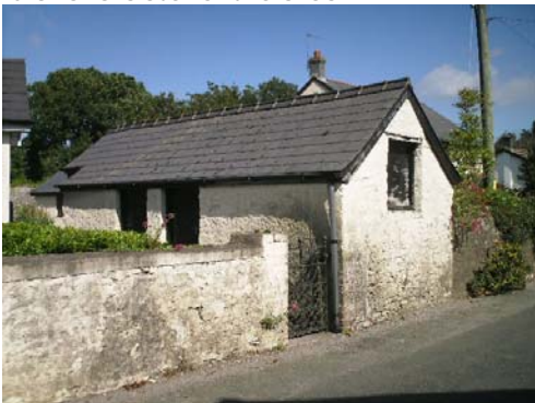
Former farm buildings provide evidence of the area's origins.