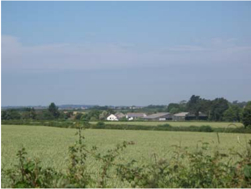
Open fields provide views over the eastern end of the village.

A steep hill also drops to the west into Barrenhill, creating good views between buildings within the village towards open countryside. The importance of the local topography is apparent in the relief map over the page.