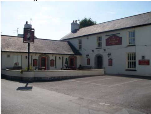
Six Bells Inn.