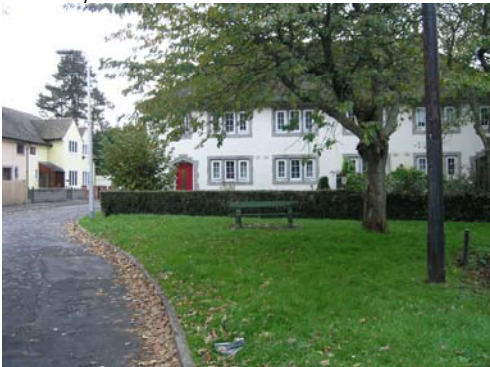
Former Rural District Council Housing at Croft John is an important element.