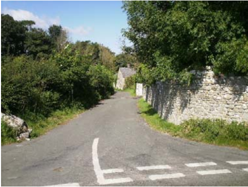
Stone walls and grass verges add to the rural character of the area.