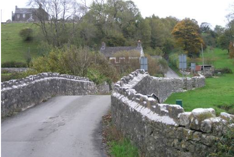
Looking into the village from the West.