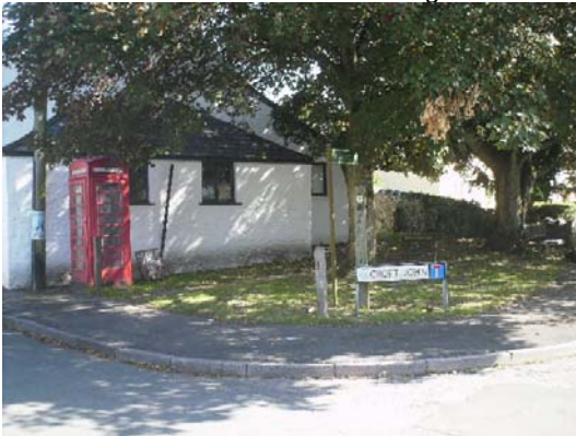
Incidental open space at Croft John.