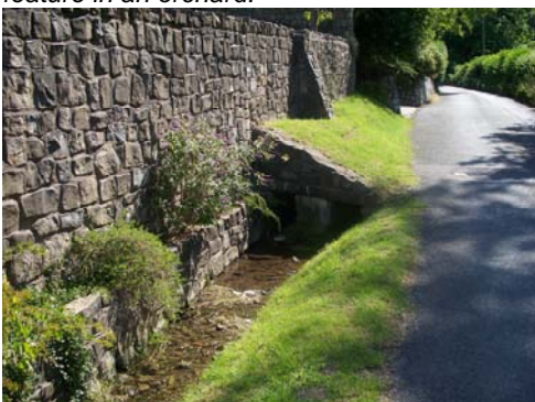
This small stream adds amenity value to the Conservation Area.