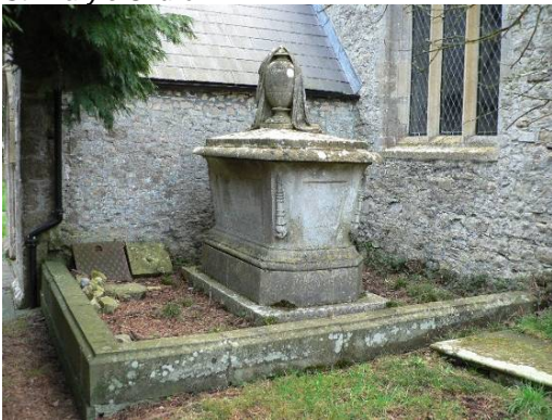
Casberd Family Tomb.