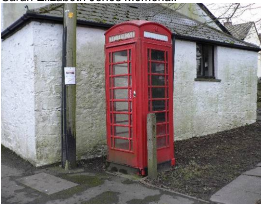
Telephone Call Box.

The County Treasures survey contains a unified list of historic built assets found within the Vale of Glamorgan. It contains listed buildings, Scheduled Ancient Monuments, as well as entries identified as being of 'local importance'. In addition to the listed buildings and Scheduled Ancient Monument noted above the following have been identified as locally listed County Treasures.