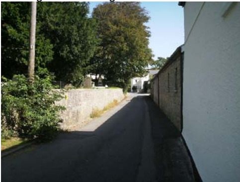
Looking east from the centre of the village.