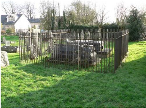
The Basset Family Tomb