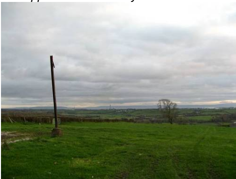
View southwards from Llantrithyd Road