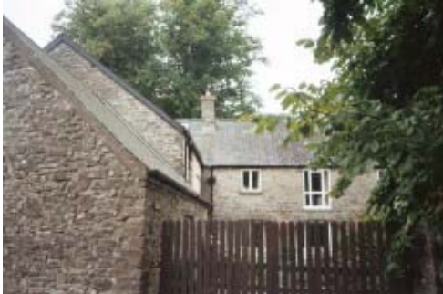
The Old Farm