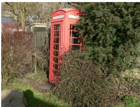
Telephone Call Box

G VI R, K6 type telephone box to the standard design of Giles Gilbert Scott, architect of London.