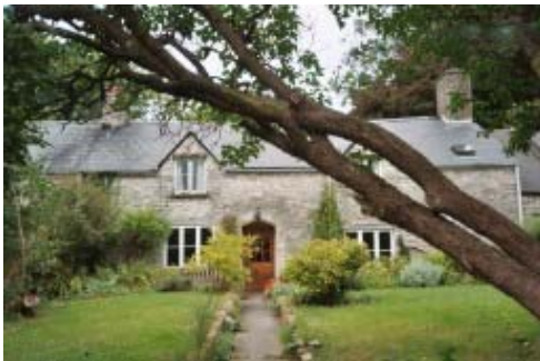
Old Post Office

C19, two-storey stone cottage with thatched roof and stack, square-headed, diamond paned casement windows, with central, square-headed doorway. Recent, single storey extension with lean-to roof.