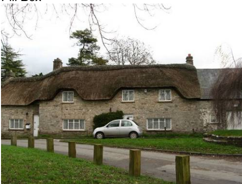
Little Hall Cottage

Two-storey C17 stone rubble built dwelling, restored and partly modernised. Thatched roof with 'eyebrow' features. External structure possibly an oven.