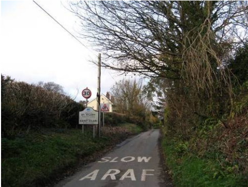
The approach to St. Hilary from the south

Of note is the convoluted street pattern with narrow, winding lanes surrounding the church with high banks on many sides, tightly enclosing the road without, in many places, room for a pavement. There are two roughly circular routes, one of which surrounds the church although the western side is now a pathway through private land. Limestone walls, grass verges of varying widths, and many fine trees, all add to the rural qualities of the conservation area.