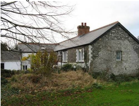
Rear view of Church Cottage from the churchyard.