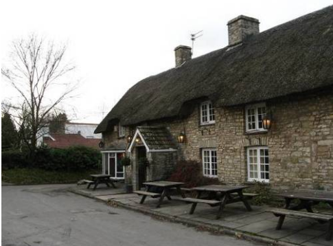
The Bush Inn

This is a mid 19 th century building, although masonry features possibly suggest earlier origins, which was once two cottages. The new casement windows have stone drip moulds above, and the roof is now tiled although early photographs show thatch.