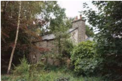
The Lodge at Pinklands

C17 house with Tudor arched dressed stone, chamfered doorways and beamed ceilings. Stonewalls and front gable windows. The village post office was first established at Manor Cottage at the end of the C19. It later moved to Ty'r Eglwys - the house now known as "Abbotswood".