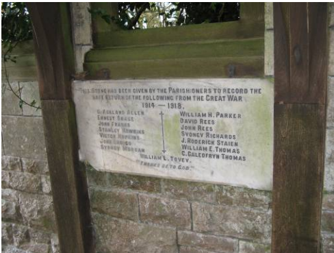
This plaque commemorates those who returned safely to the village after the First World War.