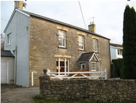
West House, one of several unlisted 'positive' buildings.