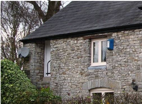
Satellite dishes and alarm boxes can detract from otherwise positive buildings.