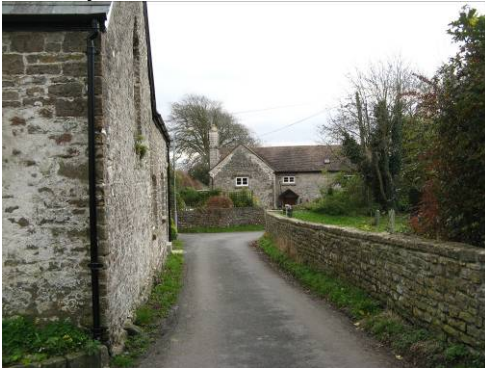
Buildings and stone walls create intimate spaces in the village.