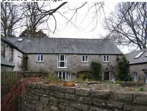
These converted barns reflect the village's agricultural origins.