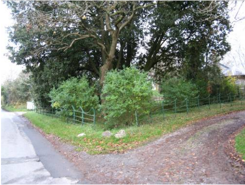
Trees play an important part in establishing the character of the village.