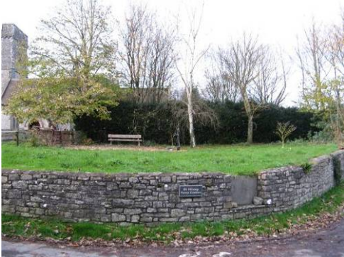
St. Mary Pump Garden.