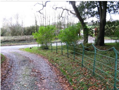
These important iron railings provide local distinctiveness.