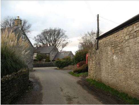
Local limestone is the predominant building material.