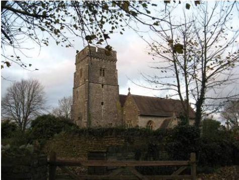
St. Hilary's Church is the focus of the village.