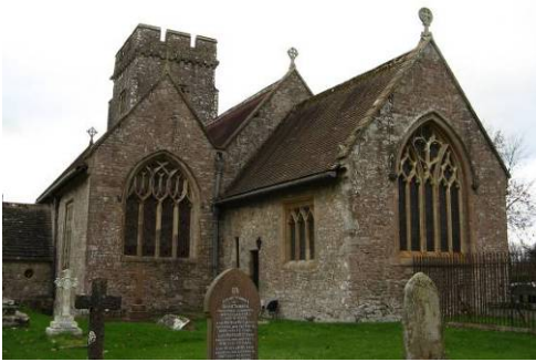
St. Hilary's Church