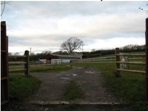
View to the north east from St. Hilary over farming land and the rising ridge