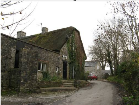
The rear slope of the Bush Inn would benefit from rethatching.