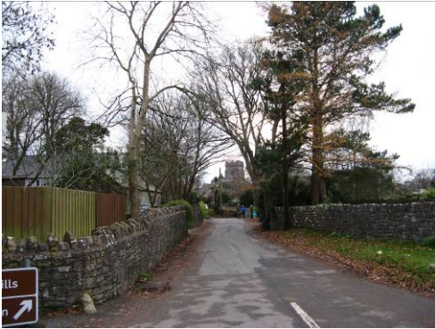
Here, trees and stone walls act as a frame to the Church.