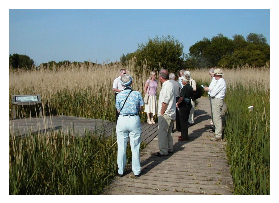
(Photograph – LAF Members and officers prior to the June 2006 meeting at Cosmeston Lakes Country Park.)

Again, at the June 2006 meeting, the Forum was advised by the Deputy Chairman that, in conjunction with the Cardiff Institute of the Blind, a walk had been undertaken to the Cosmeston Lakes Country Park, with a view to ascertaining how people with poor sight could cope with country walks. As a result, it was agreed that information for the visually impaired on walks would be addressed within the preparation of the Rights of Way Improvement Plan (ROWIP).