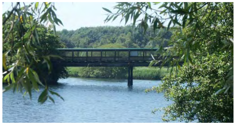
Mile Road Bridge spanning West and East lakes at Cosmeston

In relation to the Pont-y-Werin Bridge project crossing the River Ely, the Forum was informed that planning permission for the scheme had been granted and that a Memorandum of Understanding between the Vale of Glamorgan and Cardiff Councils was being drafted.