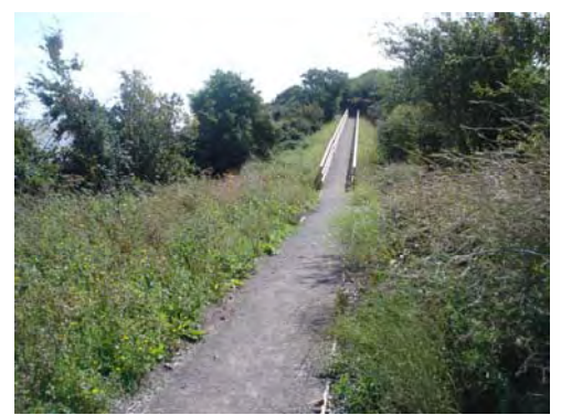
Phase two of the CAIP Lavernock Scheme

Costs shown were estimates only and no timescale could yet be given for the submission of the bid. In response to the frustration expressed by members at the lack of detail, Ms. Tindal explained the processes by which applications were determined, stating that the position would be clearer by April.