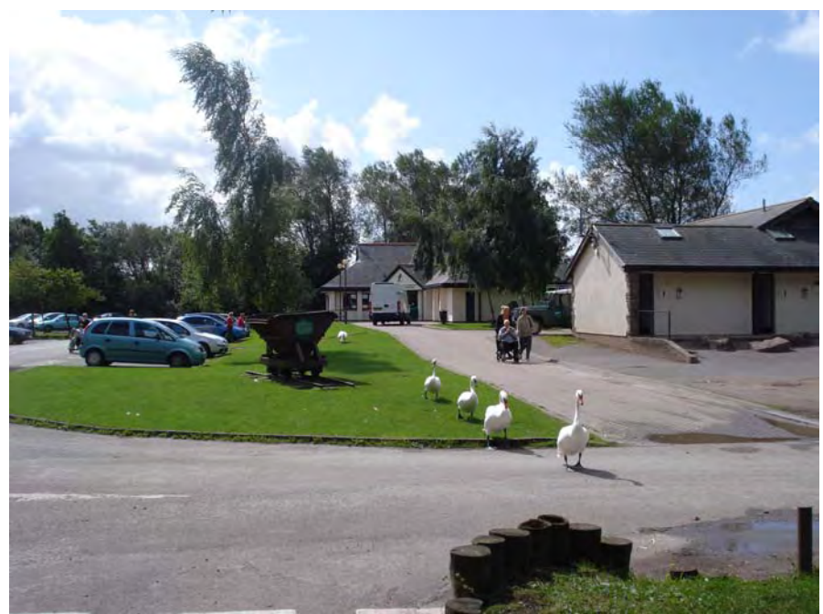
Access for all at Cosmeston

Prior to the September meeting, members of the Forum undertook a site visit to view some of the CAIP works on the cliff top between Penarth and Lavernock. The meeting itself was held at the Visitors Centre, Cosmeston Lakes Country Park, Penarth.