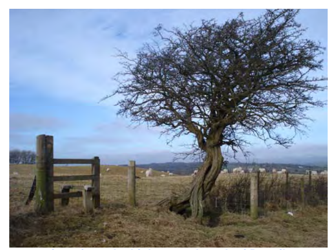
Fine open views from the high ground north of Bonvilston; part of the new Bonvilston route which will be available shortly

More recently! The Council's Cabinet subsequently approved a grant of £30,000 per annum, payable annually in advance, for three years commencing 1<sup>st</sup> April 2009. The assistance is governed by a three year Service Level Agreement.