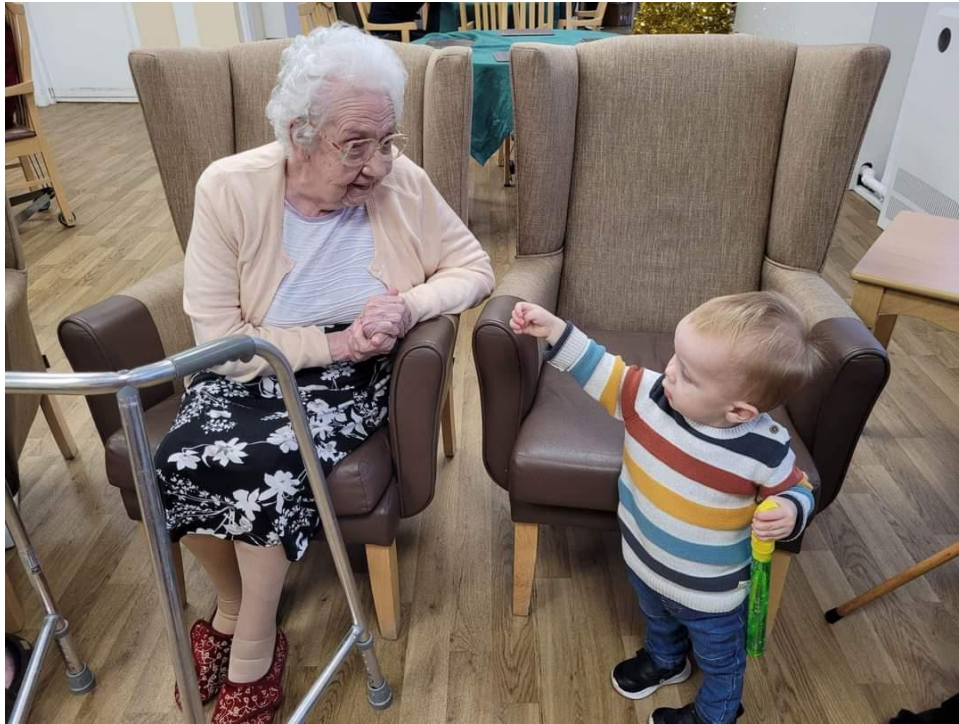
2 - Care home resident visits.

This section of the report sets out our performance in promoting and improving the key aspects of well-being of people in the Vale of Glamorgan who need care and support and carers who need support in relation to the six well-being standards.