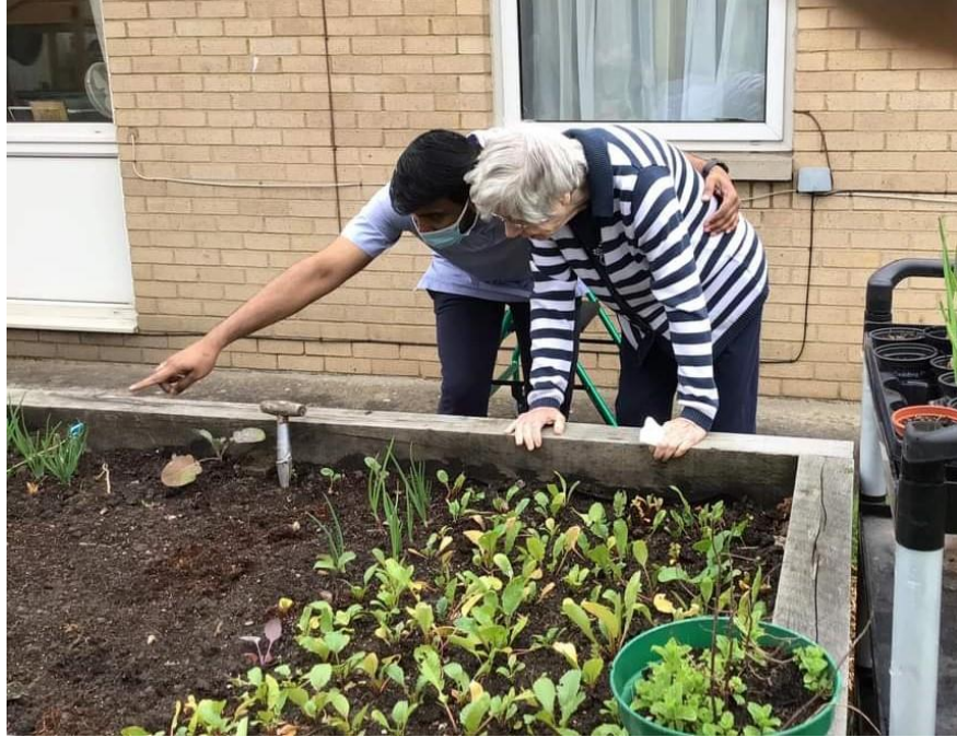
Care Home resident and staff enjoying new garden project