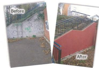
Youth Offending Service – examples of Reparation