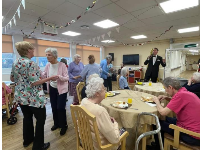
1 – Care home residents enjoying entertainment.