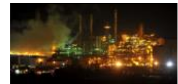
Dow Corning Works