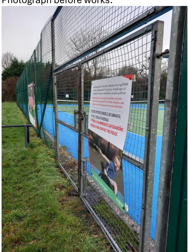
Photograph after works: