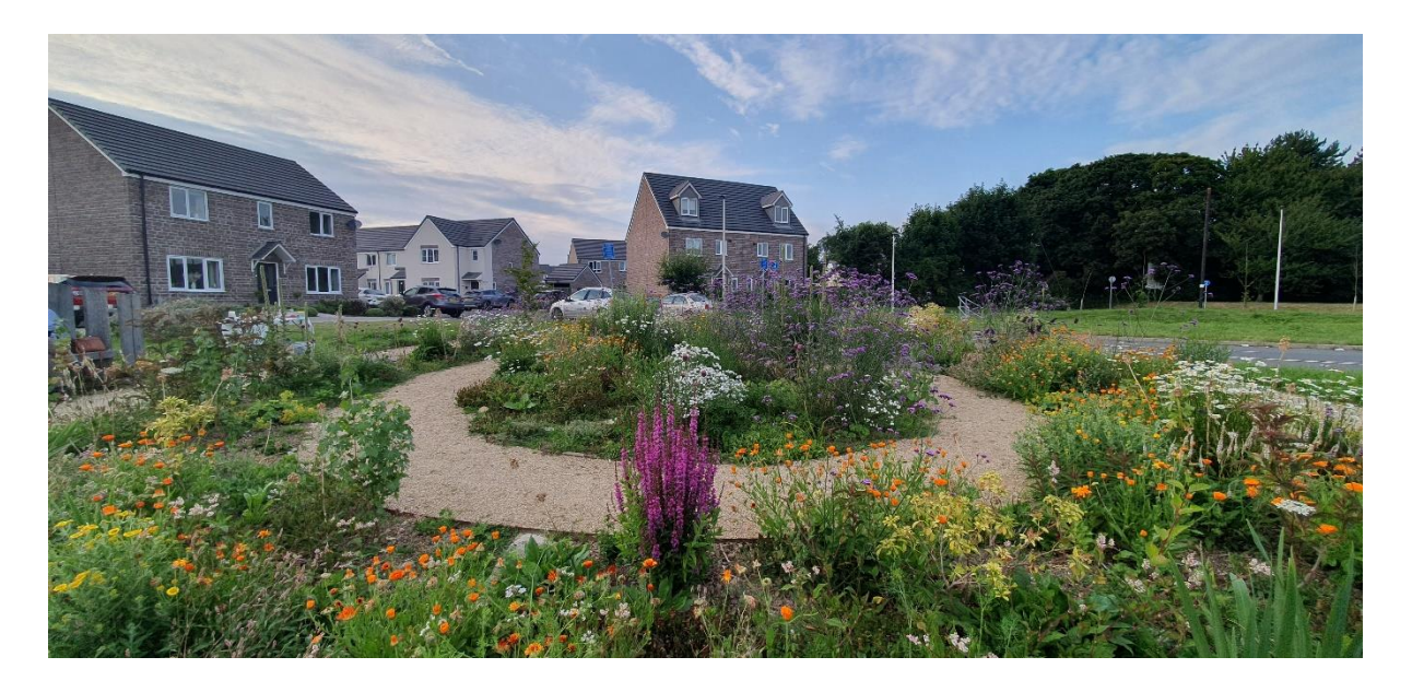
Photograph of wooden bee totems / bug hotels:

Photograph of completed community garden: