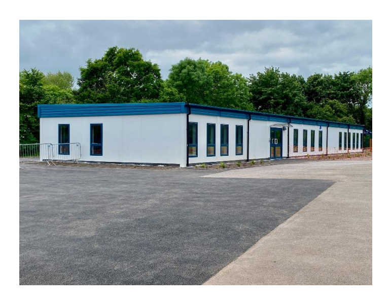
New St. Nicholas Church in Wales Primary School

Section 106 code 930265 – Sycamore Cross, Bonvilston, Education Contribution Project managed by VOGC Sustainable Communities for Learning Section Photograph of new school: