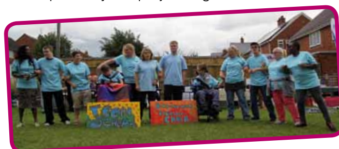
the index / y mynegai - issue 13