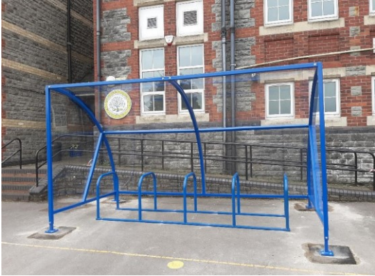
Cadoxton Primary School

FY22/23 - scooter and cycle storage provided at a further 5 schools across the Vale (Core ATF).