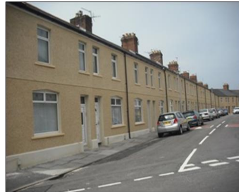
Fryatt Street – after

Council funding and Welsh Government grant supported the previous Renewal Area schemes. This allowed large areas of housing to be included in the programmes for investment. With increased pressure on budgets and the removal of Welsh Government funding, the available budget for housing renewal is smaller which means smaller geographic areas need to be targeted for future investment.