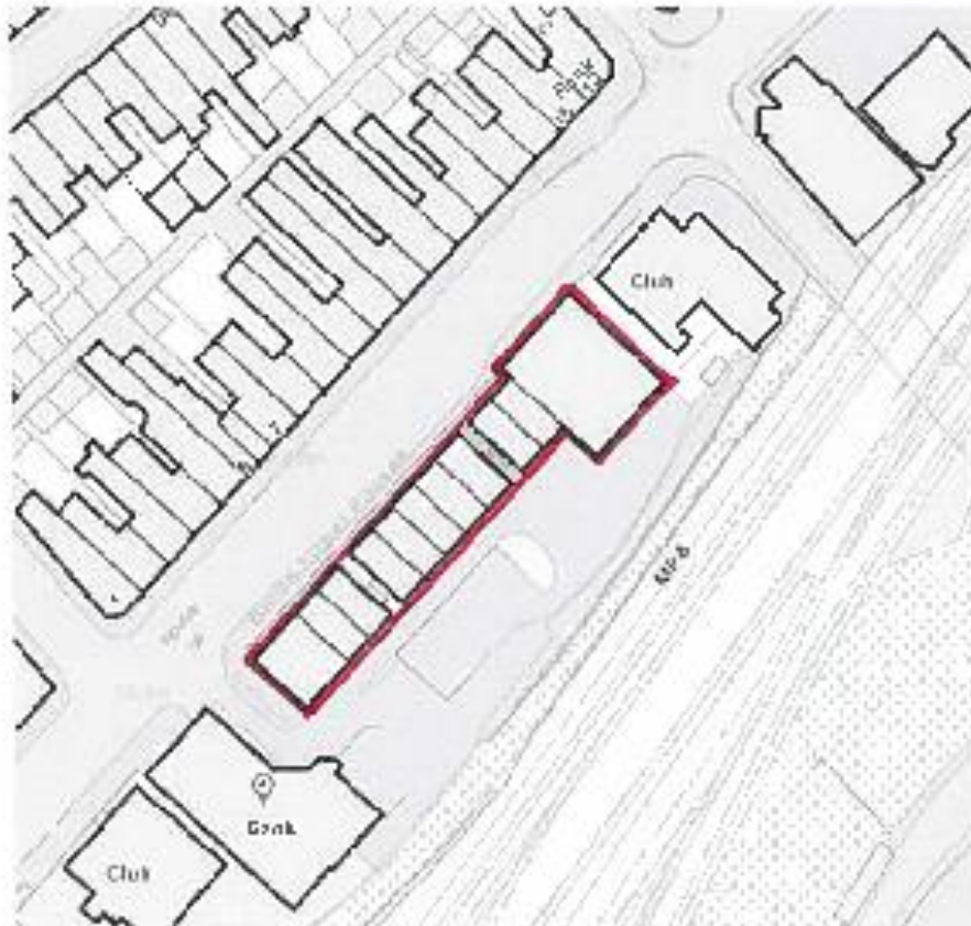
Plan of Broad Street Parade Housing Regeneration Area. Red outline sets the boundary of the scheme.