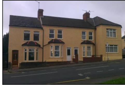
Lower Pyke Street – after