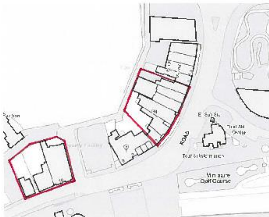
Plan of Paget Road Area. Red outline sets the boundary of the scheme.

The housing regeneration scheme will take the same approach as the work completed in the Castleland Renewal Area. It will cover residential properties Numbers Nos. 2–7 and 10–12 Paget Road as outlined in the plan below. The scheme not allow for the renewal of the shop fronts, but consideration will be given in the development of the schemes specification to the canopies attached to the commercial premises on the ground floor of these blocks.