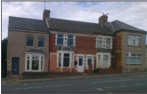
Lower Pyke Street – before