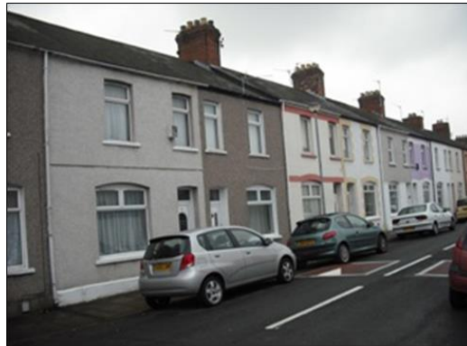
Fryatt Street – before