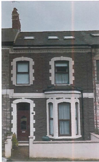
TYPICAL HOUSE TYPE