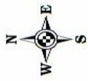
MAP OF THE VALE OF GLAMORGAN

© Crown copyright. All rights reserved. The Vale of Glamorgan Council Licence No. 100023424 2006. © Hawlfraint y Goron. Cedwir pob hawl. Cyngor Bro Morgannwg rhif trwydded 100023424 2006.