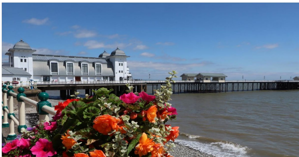
PENARTH PIER PAVILION – VENUE HIRE 2022/2023