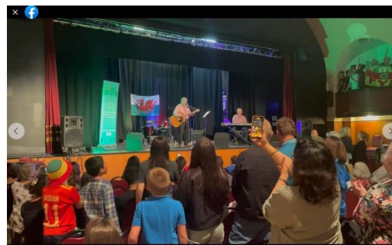
Dafydd Iwan performs at the Paget Rooms, Penarth.