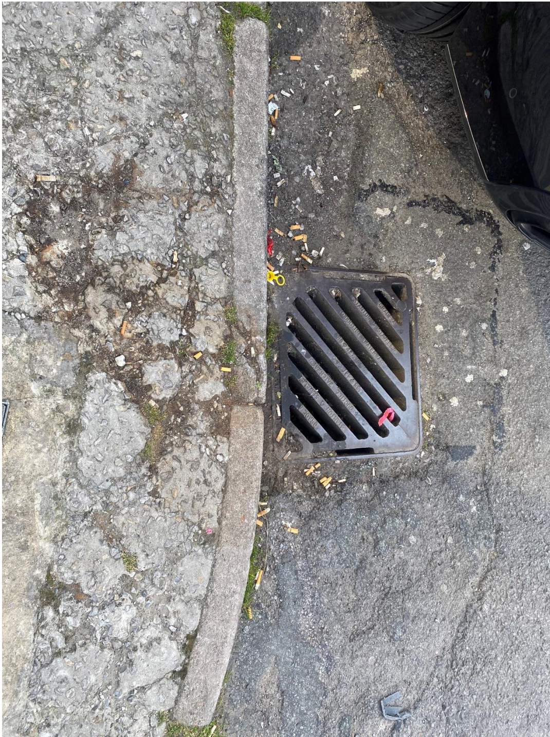
Representation 5 – Photo 1