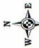
MAP OF THE VALE OF GLAMORGAN