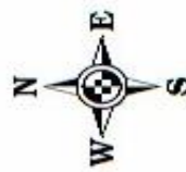
MAP OF THE VALE OF GLAMORGAN

© Crown copyright. All rights reserved. The Vale of Glamorgan Council Licence No. 100023424 2006. © Hawlfraint y Goron. Cedwir pob hawl. Cyngor Bro Morgannwg rhif trwydded 100023424 2006.