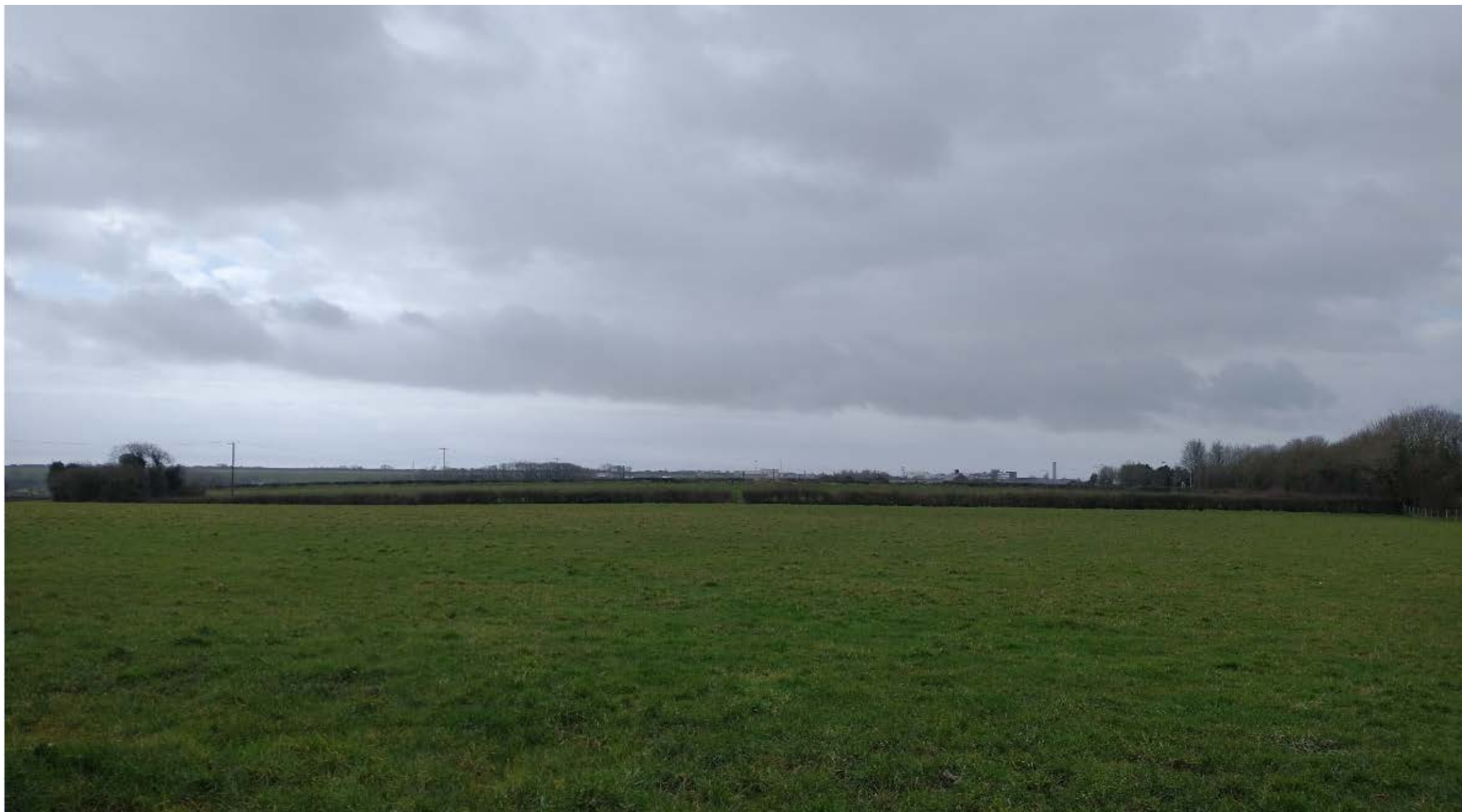
Site Photograph 8 – View across site from footpath toward Model Farm (west)