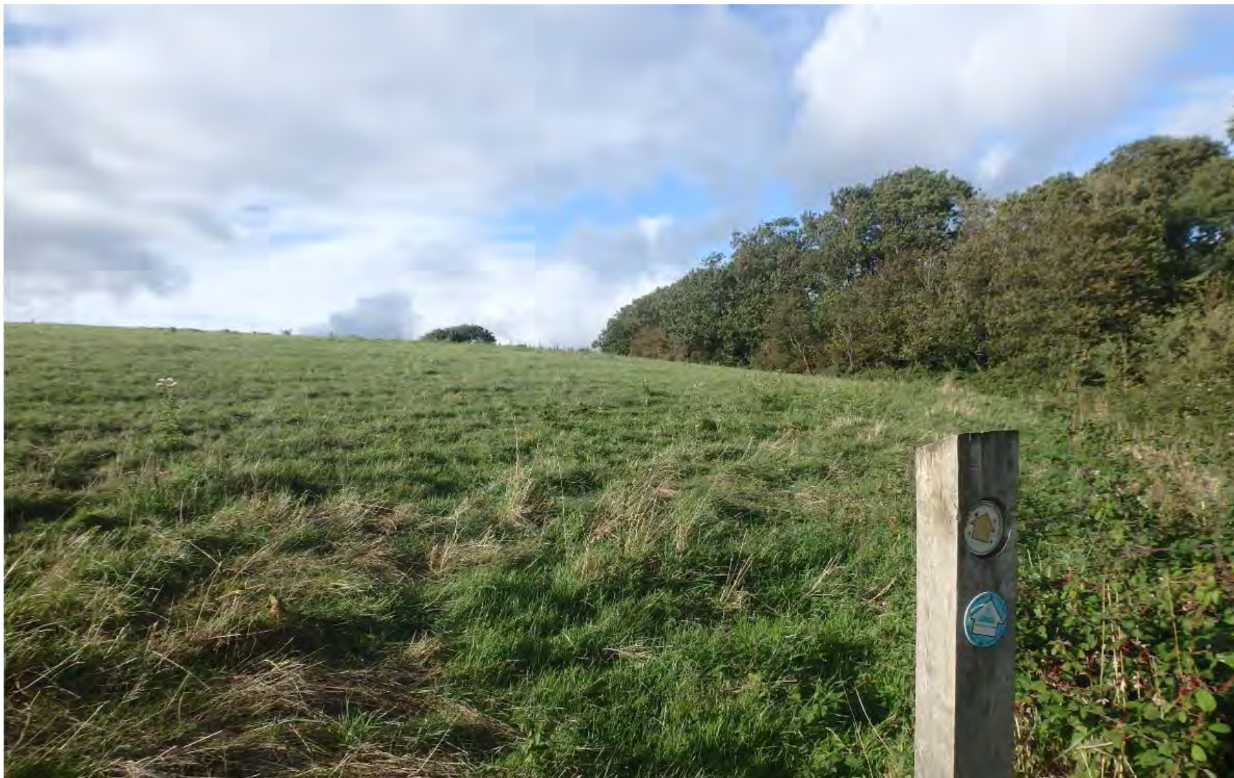
2019/00871/FUL – Land at Model Farm, Port Road, Rhoose