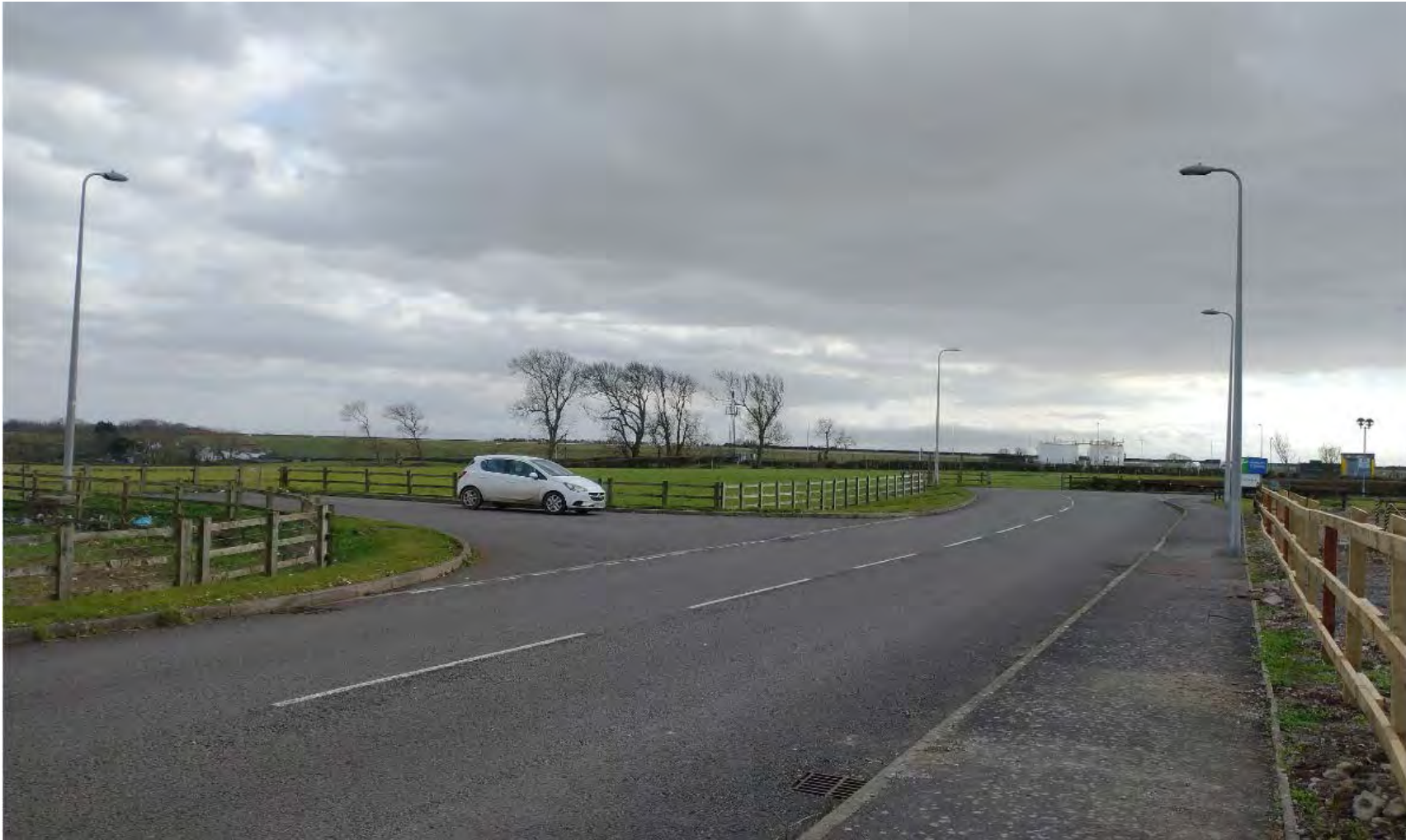
Site Photograph 12 – View of western site access (Holiday Inn access road)