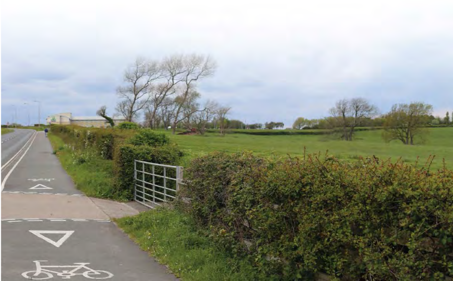
Site Photograph 14 – View over site (from Porthkerry Road)