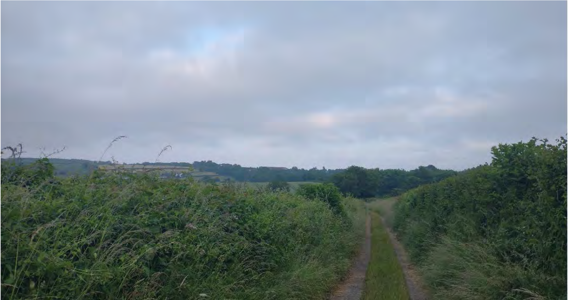
2019/00871/FUL – Land at Model Farm, Port Road, Rhoose