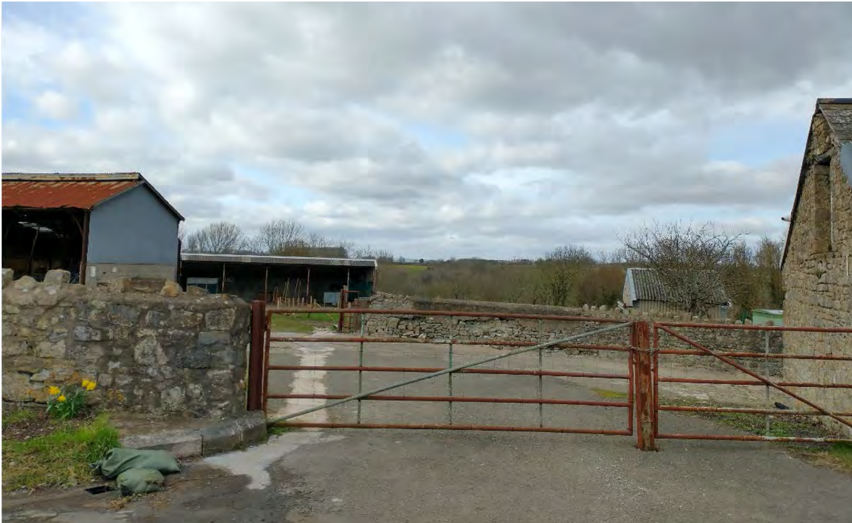
Site photograph 3 - View toward site from south (from Porthkerry/ Cliff Farm)