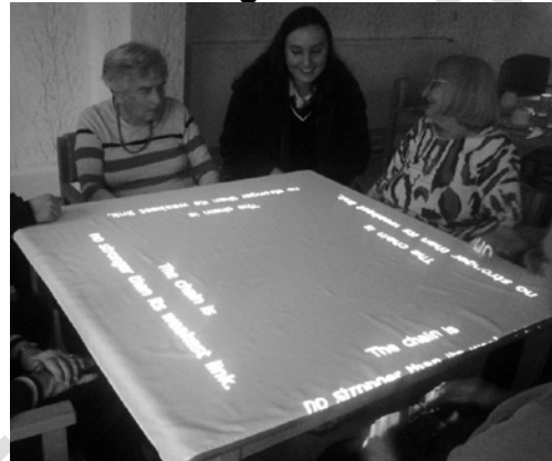
Cowbridge Comprehensive pupils participating in a Tovertafel activity with residents