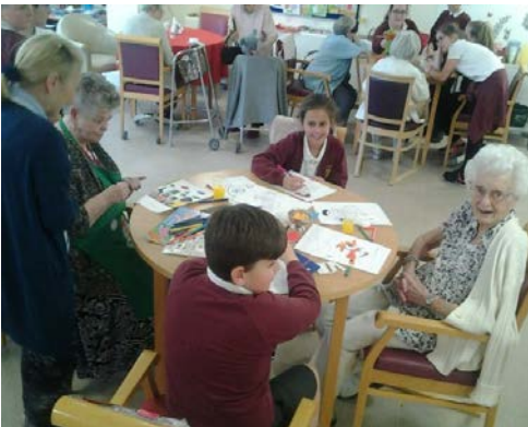
Romilly School pupils – arts and crafts sessions.