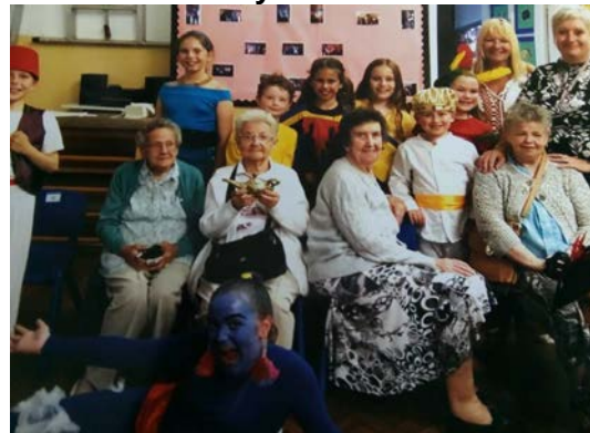
Cartref residents attended Romilly Primary School's Panto - Aladdin.

Example of letter sent to a Cartref resident from a Romilly Primary Pupil as part of the Pen Pal initiative.