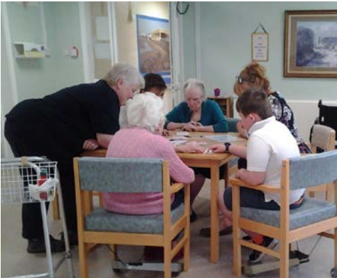
Y Bont Faen Primary pupils - arts and craft sessions