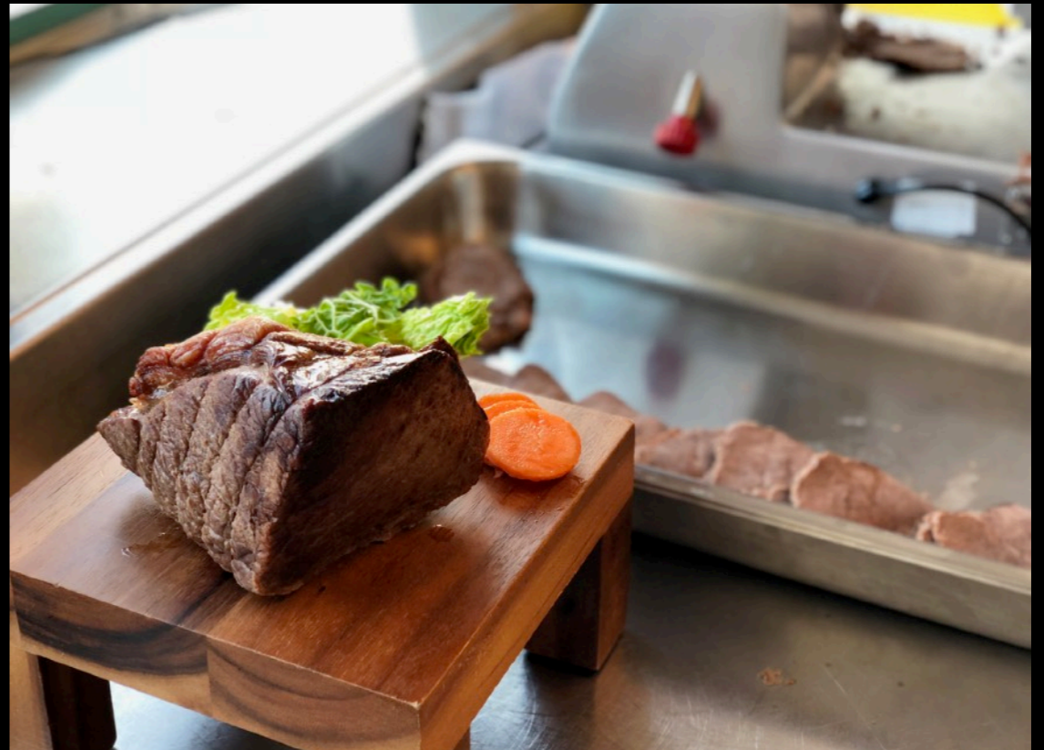
Pencoedre High School