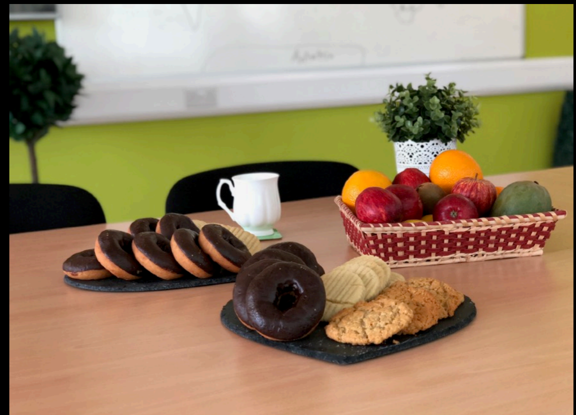
Pencoedre High School