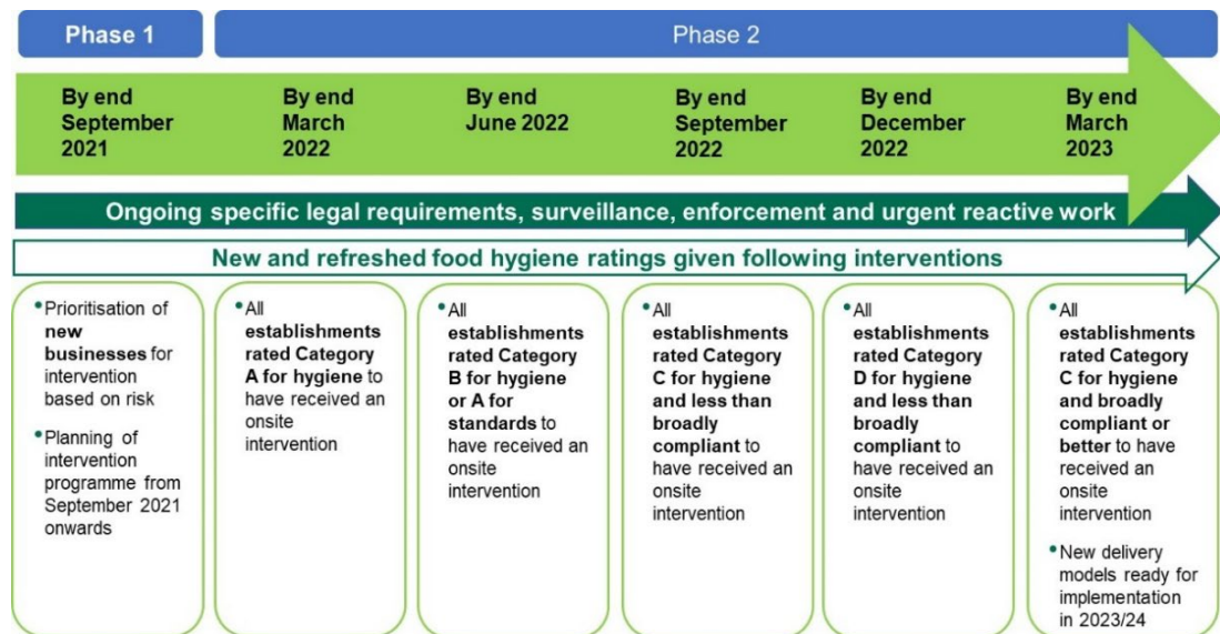
Figure 1: FSA COVID-19 Local Authority Recovery Plan

2.7 The Service updates below provide more detail and context for the Joint Committee on some of the key areas of work during the quarter.