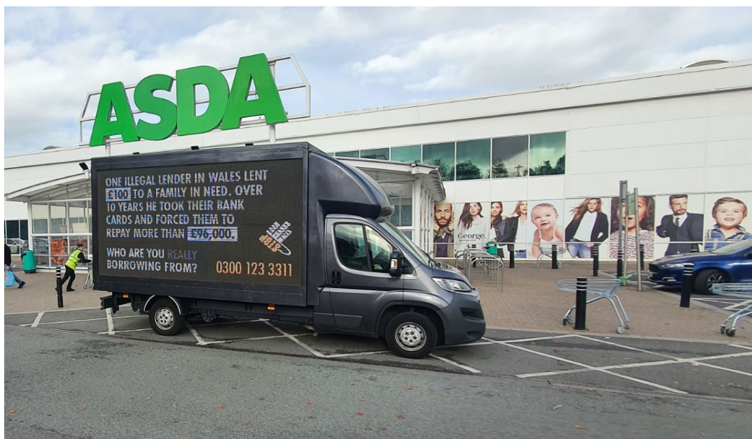
Figure 2 – Stop Loan Sharks Wales Launch Campaign

Email: stoploansharkswales@valeofglamorgan.gov.uk