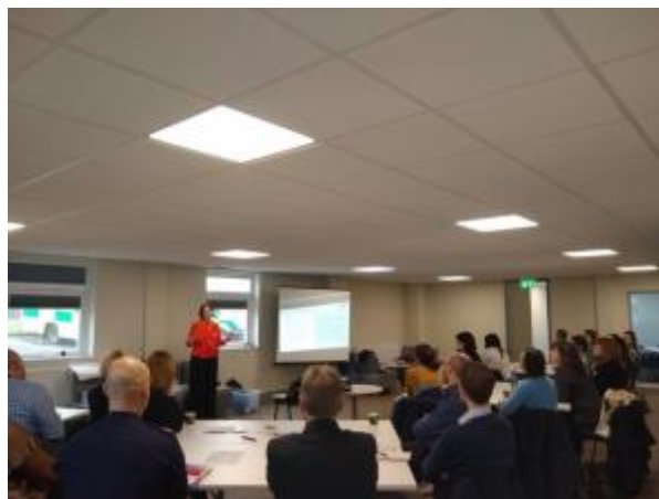
5 - Children's Rights Toolkit Engagement Workshop