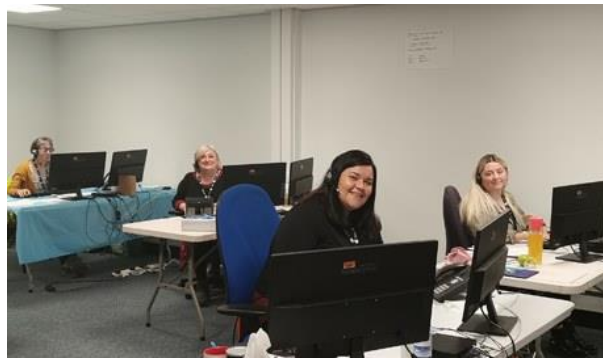
24 - The Crisis Support Team