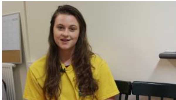
6 - Timebanking in the Vale - Cwtch Cymru

volunteering time. Members report marked improvements in their self-esteem, increased levels of confidence, new skills and feelings of well-being.