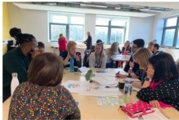
4 - Move More, Eat Well Engagement

FoodVale continues to involve a wide range of organisations and food providers and this has been of vital importance to work taking place to meet the needs of vulnerable people during the outbreak of COVID-19.