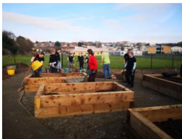
7 - Community Gardening Timebanking Project

http://twitter.com/statuses/1156595934148648960