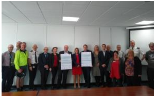
19 - Partners signing the Vale Staff Healthy Travel Charter