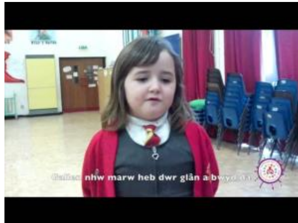
3 - Why are children's rights important? The Children's Commissioner for Wales.

castle and a climbing wall helped to attract visitors who then had an opportunity to learn more about different services and help shape a new community safety strategy.