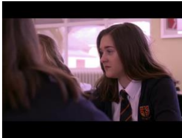
20 - School Health Research Network Overview