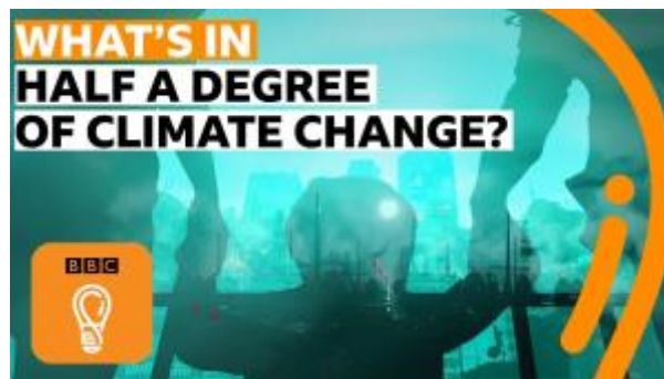
2 - BBC Ideas: How half a degree could change the world forever

Achieving a carbon neutrality by 2030 is a huge task and will require partners to rethink the way we deliver a number of services and operations. The reduction of carbon emissions within the public sector and a transition to a low carbon economy takes aim at the three key areas which are; buildings, transport and procurement. A key task in understanding the scale of the issue is understanding the scale of the emissions from various sectors and within the control of partners. NRW have undertaken the Carbon Positive Project funded by Welsh Government to show leadership in how the public sector can reduce its carbon impact to tackle climate change.