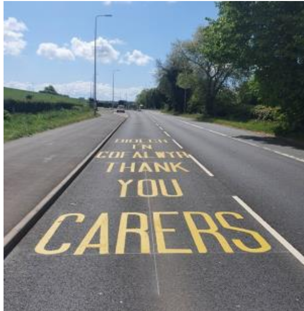
23 - Thank you road markings across the Vale