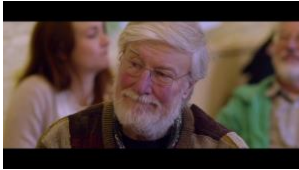
22 - CRC Food and Farming Future for the Vale Event 2019